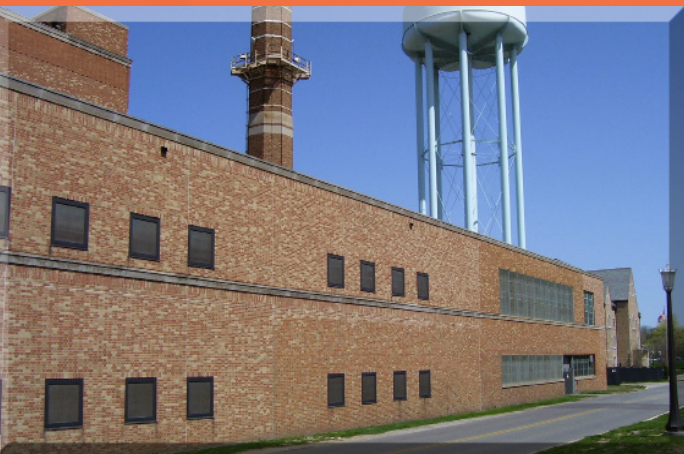
2008 | BEFORE