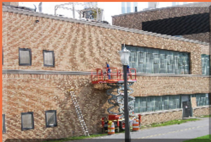
2008 | DURING