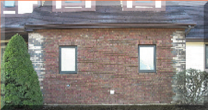
2008 | BEFORE