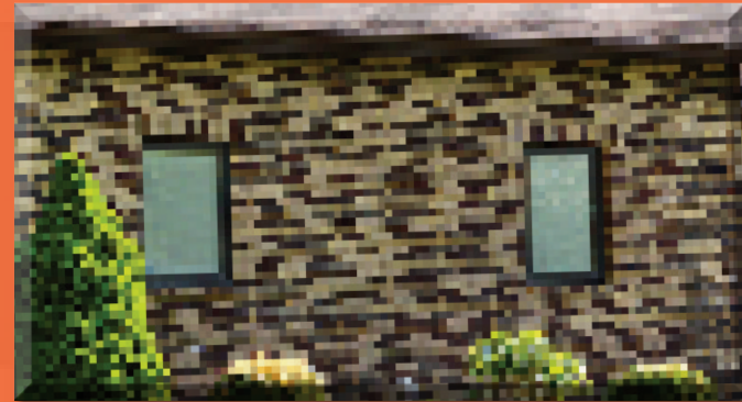
2023 | AFTER