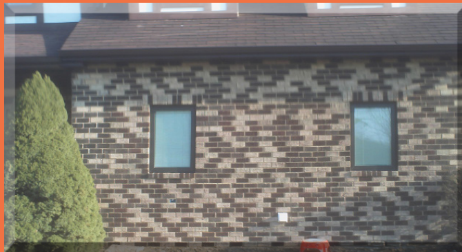
2008 | AFTER