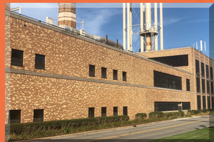
2022 | AFTER